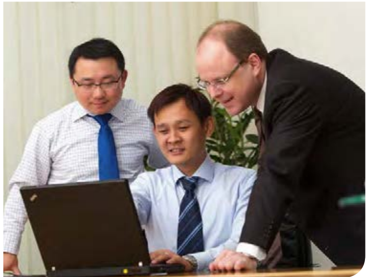
The management team for the Asian Region planning customer visits in China and Singapore

Masterflex combines innovative flair in the product development with a commitment to precision and quality in production. As a result, Masterflex is today already capable of providing long-term and durable solutions on a global basis to a multitude of demands in the field of connection systems. And our team of technical experts is even now working on the next generation of flexible connection solutions – the ‘multi-talented hoses’ of the future.