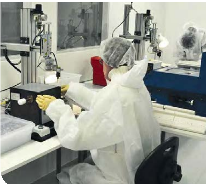
Rigorous testing in the cleanroom at Fleima-Plastic

Since its establishment in 1974, Fleima-Plastic has had its own mould-construction facilities. A large number of injection-moulded parts are further processed into installation-ready products or are installed in component assemblies. Fleima-Plastic ensures quality across all the processing stages; customers receive document-controlled quality products and benefit from low costs due to minimised logistics.