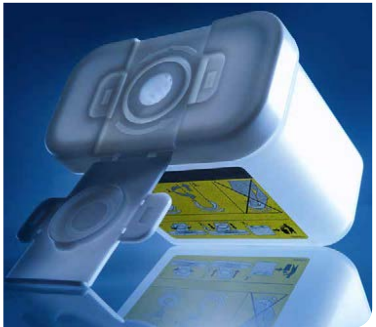
Cannula collection boxes: organisation made easy in medical rooms

Fleima-Plastic is always the obvious choice when it comes to seeking expert advice on the development of new products requiring individual or multiple injection-moulded parts. On the basis of ideas, sketches or a list of specifications, we transform our customers' plans into marketable products. Following the prototype phase, Fleima-Plastic is then able to swiftly start the managed production using its own precision moulding & tool construction facilities.