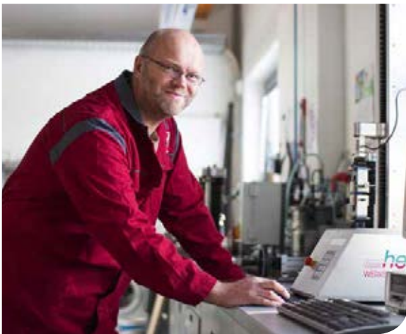
Testing materials in the incoming goods inspection department at Matzen & Timm

We serve customers all over the world: multinational companies with production sites and technical distributors around the globe, medium-sized commercial businesses, as well as the construction sector, manufacturers of medical technology and transport providers (road, air and rail). Our team advises you on-site, which is precisely where you need us and our expertise: in Europe, Asia and the Americas.