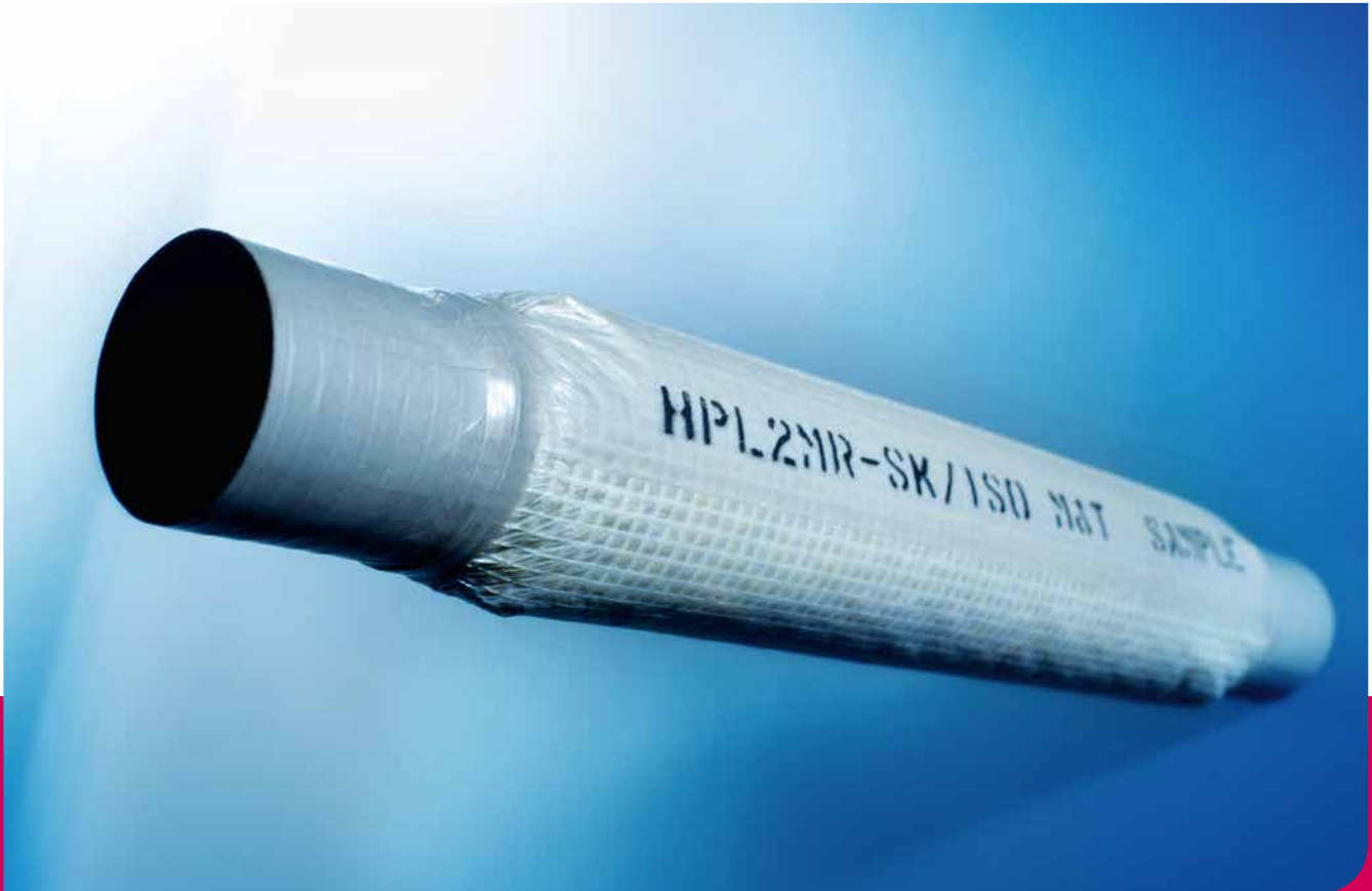
Insulated ventilation hoses reduce heat-loss in aircraft air-conditioning systems