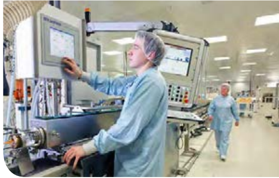
Specialist tubing for the medical technology industry is manufactured in the cleanrooms at Halberstadt, Germany

Throughout the world, virtually all processors are produced on machines which are controlled down to the micron by products from Novoplast Schlauchtechnik. Cars are manufactured by robots which are themselves manufactured using XFlame® hoses and pneumatic hoses from this brand.