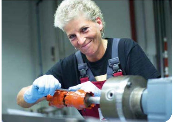
At our site in Norderstedt, Germany, we carry out production processes by hand to ensure the highest level of quality

These intricate yet robust products are manufactured in part by hand and ensure essential functions in a multitude of industrial applications. Yet another advantage is that batch sizes can vary greatly.