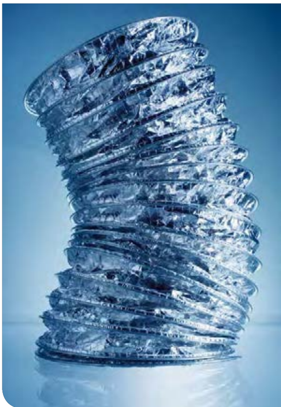
Fire-resistant metal spiral connection for building ventilation