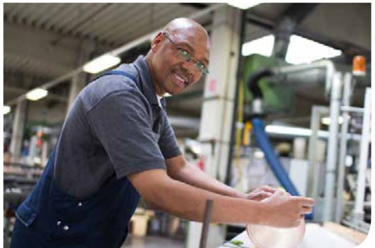
Applying the finishing to freshly-produced spiral hoses

Masterduct also sells all of our Masterflex and Novoplast Schlauchtechnik products in North and South America. With the wide range of products including profile-extruded hoses, smooth, film/foil and fabric clip hoses, as well as the templine® heated hoses, Masterduct offers solutions for the most challenging connection applications throughout all industrial and manufacturing sectors.