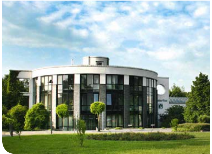
Our Headquarters in Gelsenkirchen in the German Ruhr district, Germany

What’s it all about? Our many years of expertise in the field of high-tech plastics – and not least the experience of our employees in a multitude of practical applications from industry and commerce – help us to meet these challenges.