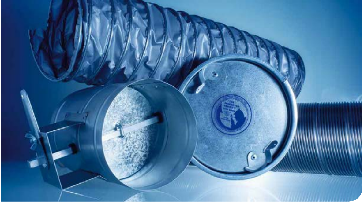
A selection of highly efficient metal connection elements for use in building ventilation