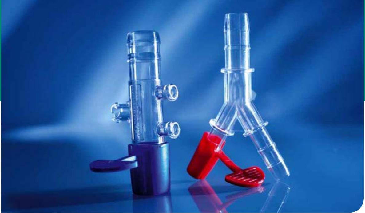
Tube connector with caps and Y-connectors for medical technology applications, such as heart and lung machines